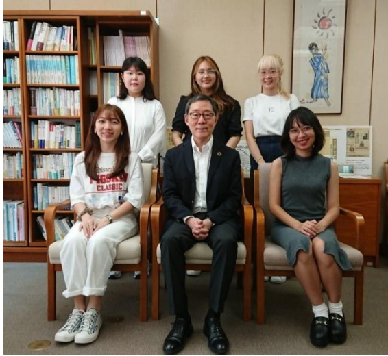
Welcome Meeting with President